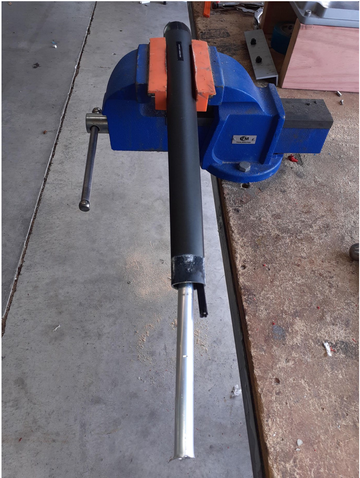
1.5 Front Tiller Arm separated from Tiller Junction for rebuild.